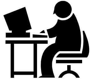
The newsletter editor.