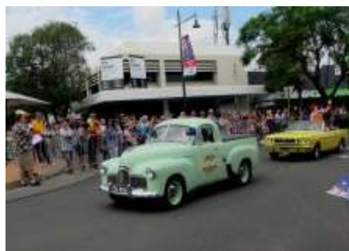
Right: Our Holden Ute in the parade with Ronald McDonald following in a Mustang