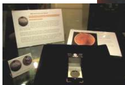
Left: the token and information in the glass cabinet.