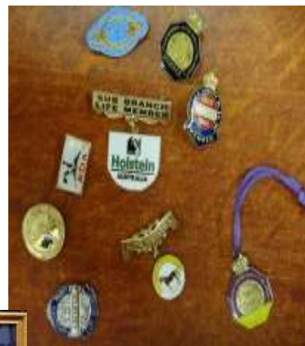
Above: pins from various organisations

'For service to the agricultural show movement, to the dairy industry, particularly through the Holstein-Friesian Association of Australia, and to the community'.